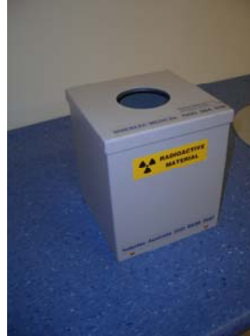
Table Top or Wall Mounted Sharps Container

Made from durable powder coated steel, these 2 litre sharps containers are designed for when space is a premium. Either as a bench top or wall mounted unit, these sharps containers feature 5mm Lead lining and house the 2 Litre IDC Sharps container.